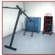
Set-Up the Hoisting Frame