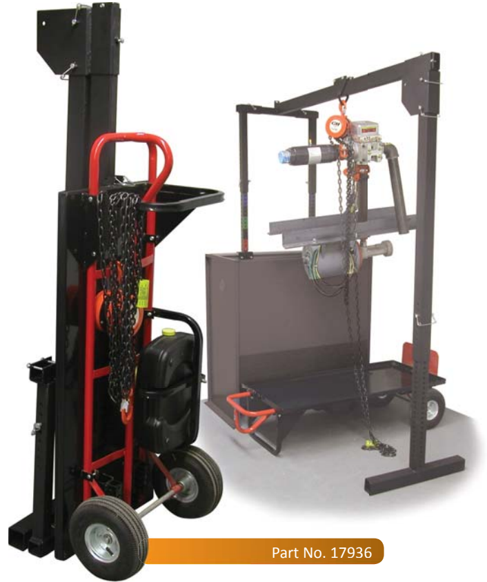
Part No. 17936

Roll the Pully Bully into the machine room. Detach the hoisting frame from the cart (the cart/drip pan will later serve as a workbench that collects the excess oil). Set up the hoisting frame (see photos below). Use the chain hoist to rig and pull the pump/motor combination out of the power unit. Set the pump/motor combination on the cart/drip pan, and make the necessary repairs.