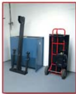
Detach the Hoisting Frame